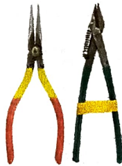
Plier & Cutter